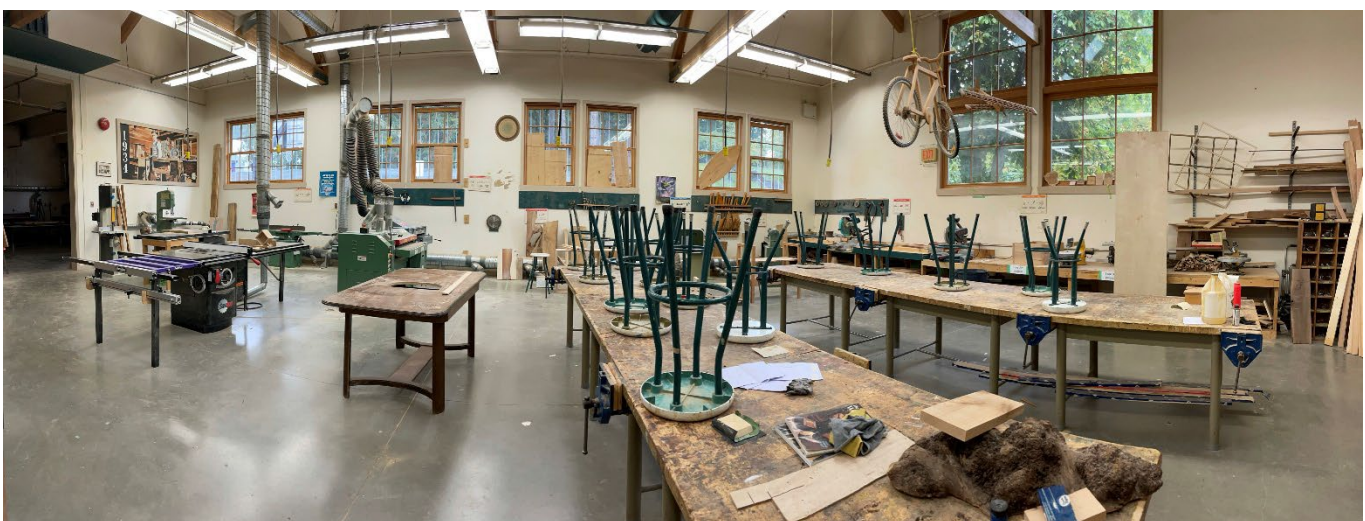
Woodworking shop: used for ceramics including hand building and throwing