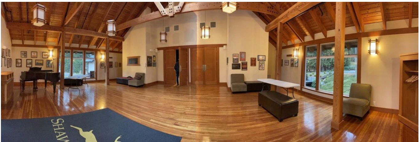
Theatre entrance: often used for plein air, weaving or improv-type workshops