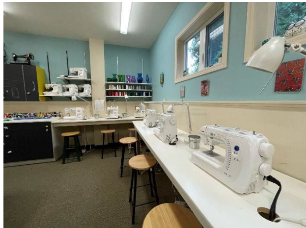
The main room for textile workshops